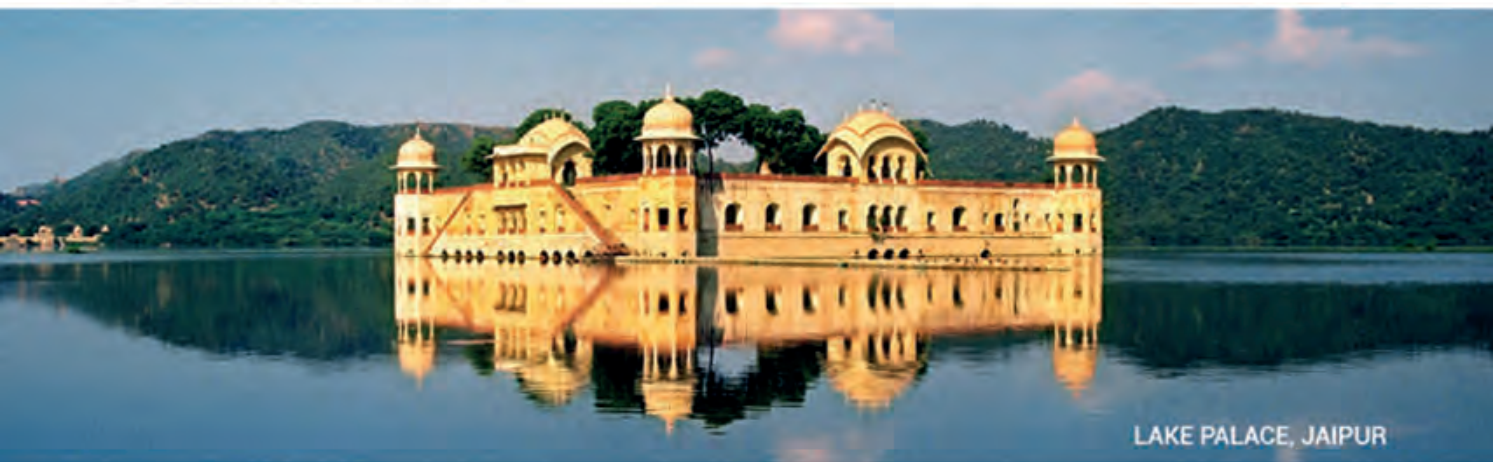
LAKE PALACE, JAIPUR

Jaipur is a popular tourist destination in India and serves as a gateway to other tourist destinations in the State of Rajasthan.