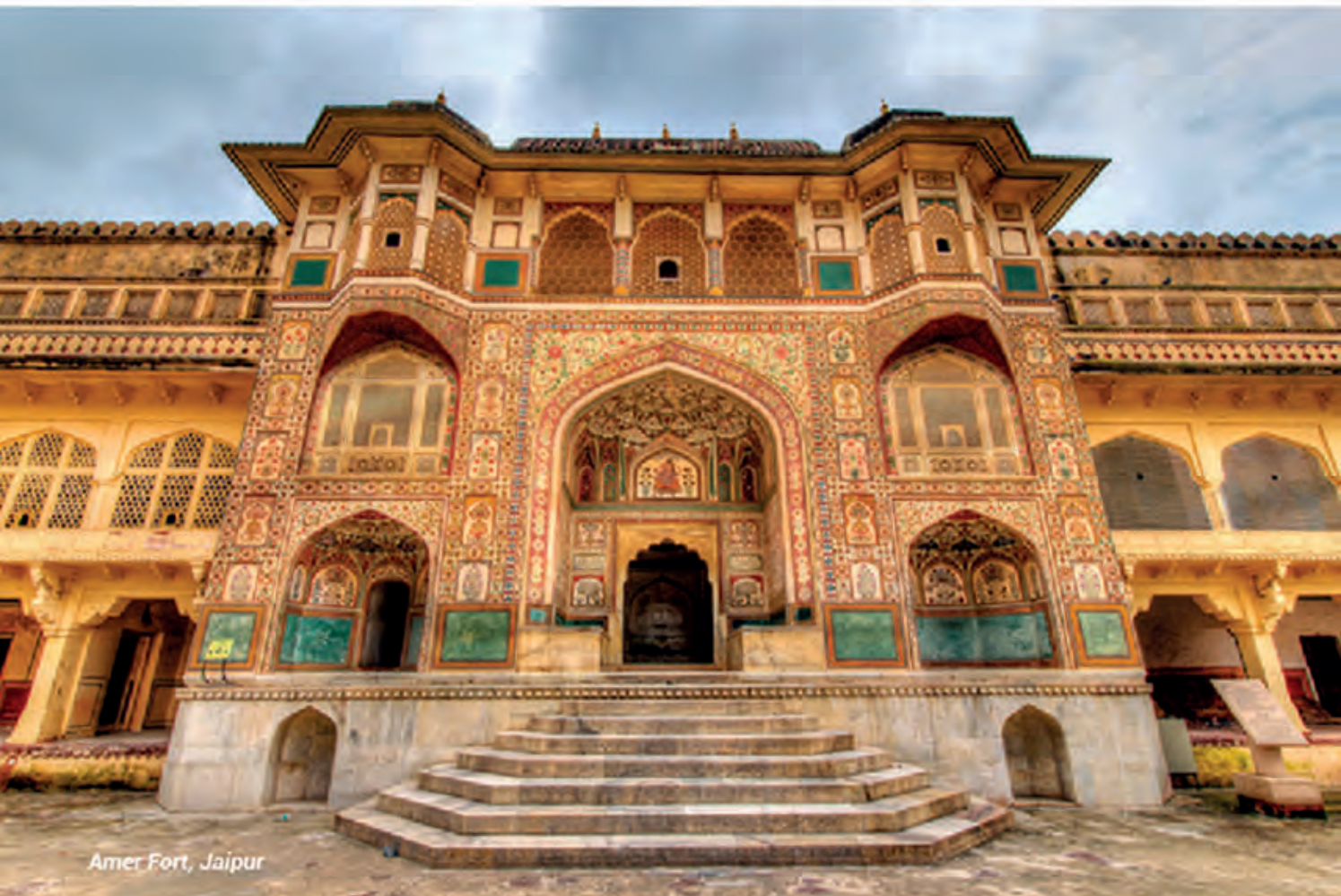
Amer Fort, Jaipur